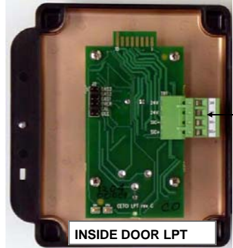
INSIDE DOOR LPT

LPT 3-WIRE ANALOG TRANSMITTER WIRED TO DCC DUAL CHANNEL CONTROLLER