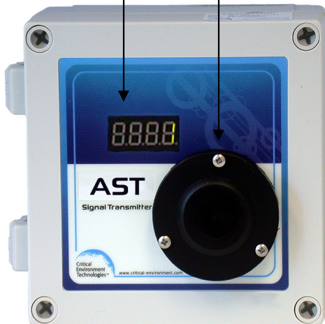
OPTIONAL SPLASH GUARD

CRITICAL ENVIRONMENT TECHNOLOGIES CANADA INC.