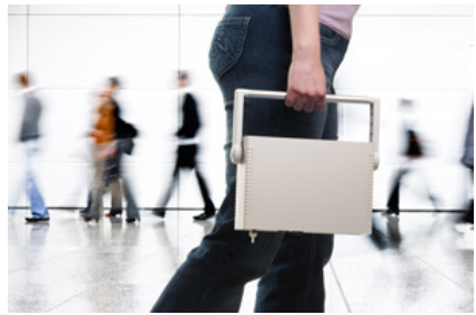
YES Plus LGA (picture above) is housed in a rugged ABS enclosure with swivel handle to act as a stand support or for carrying the instrument.