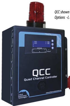
QCC shown with Options -L and -SW.