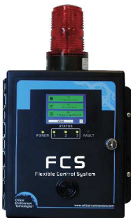
FCS shown with Options DL and L